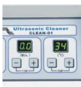
Adjust Time and Temp.