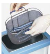
Special basket for cleaning